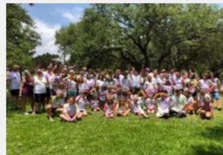
Color Fun 'Run'